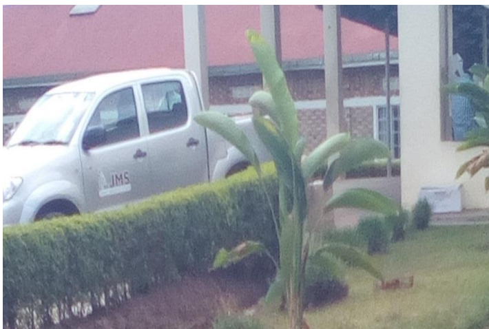
Joint Medical Store delivering drugs at RMH